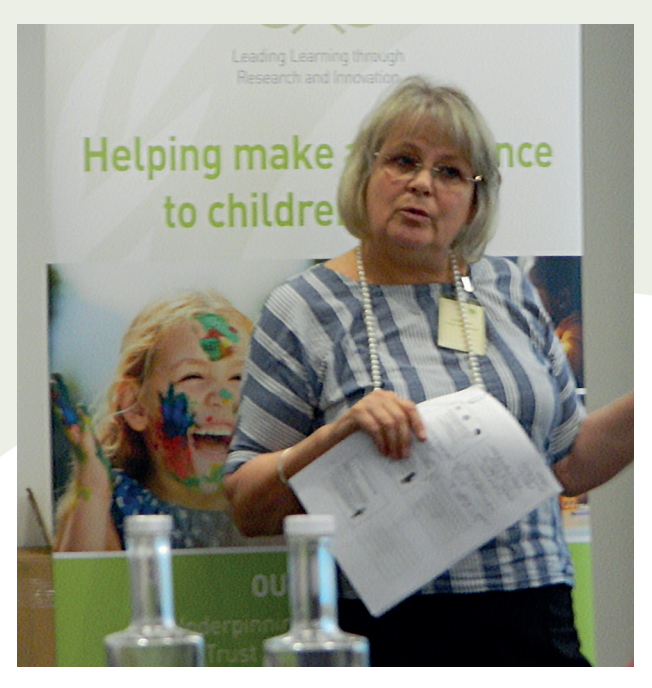
Sharing our Research

"The implementation of ETB has been extremely successful and has mirrored the impact of previous ICAN research."